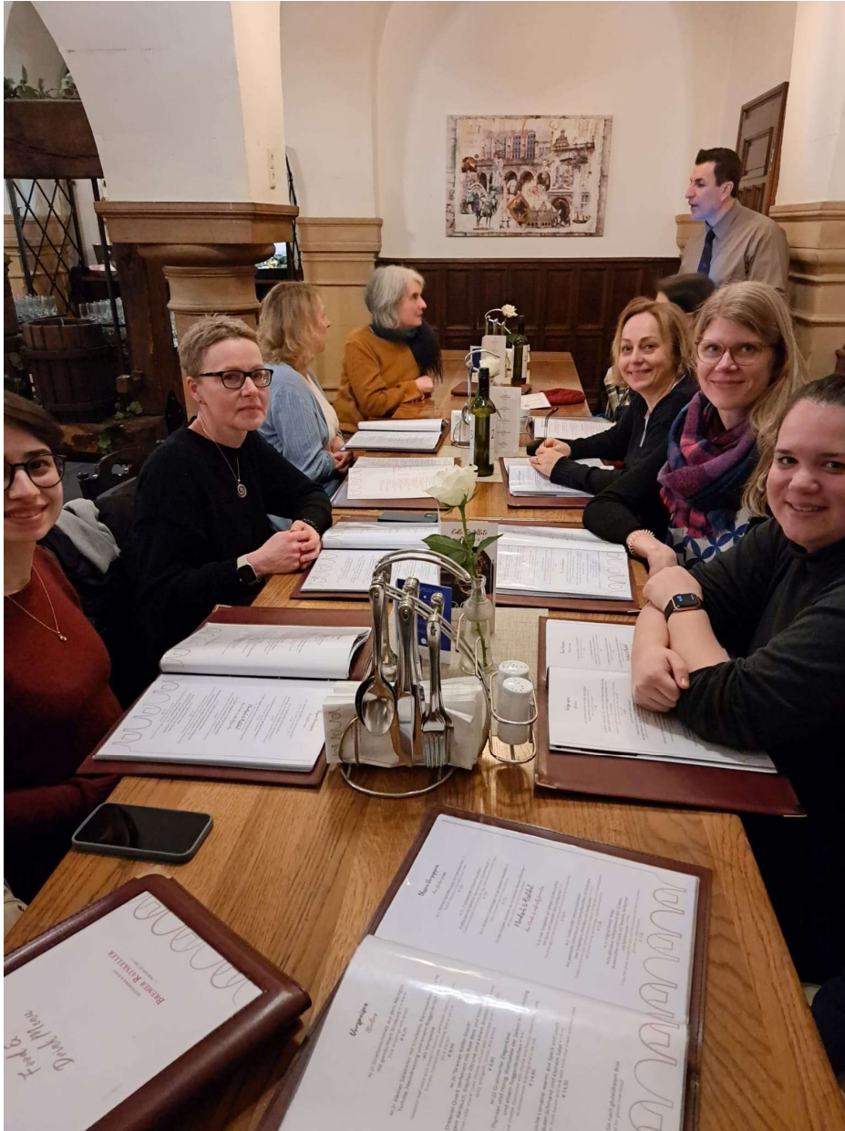
After the meeting on this day the participants had a chance to network and see the hosting city during a guided tour.